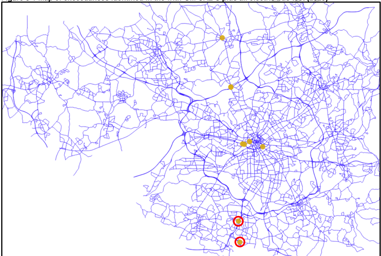
Figure 3-2 Map of exceedances identified in the with-GM CAZ C plus all electric bus test, city centre (2023)